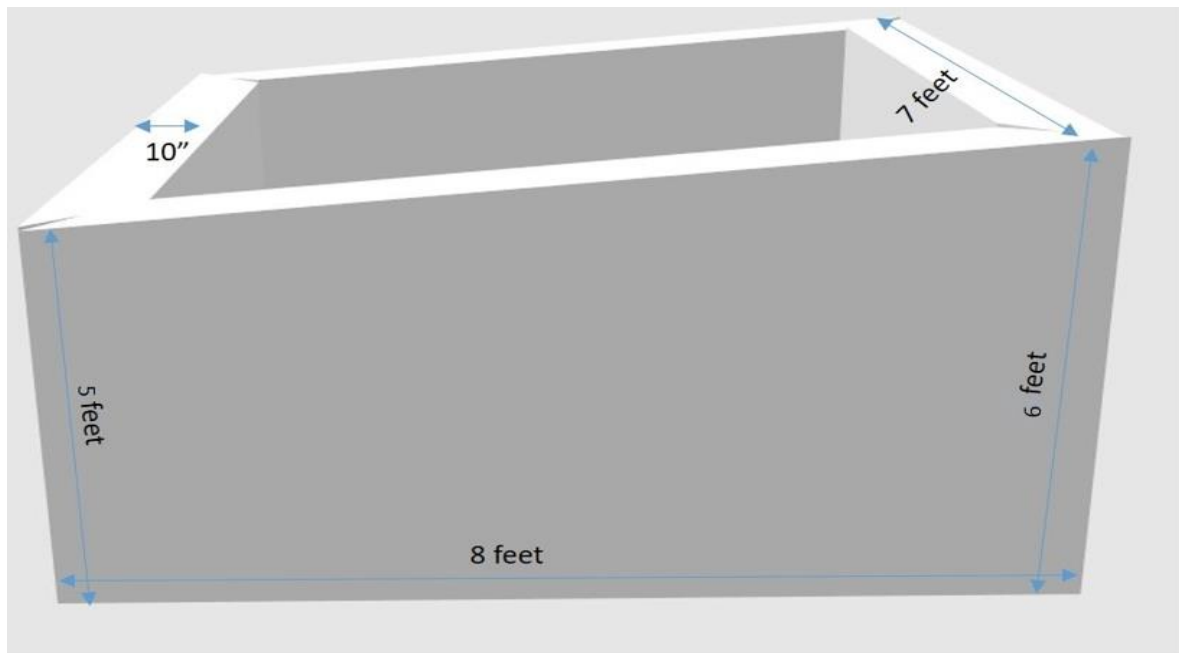
View of DFM chamber to be Constructed using concrete block